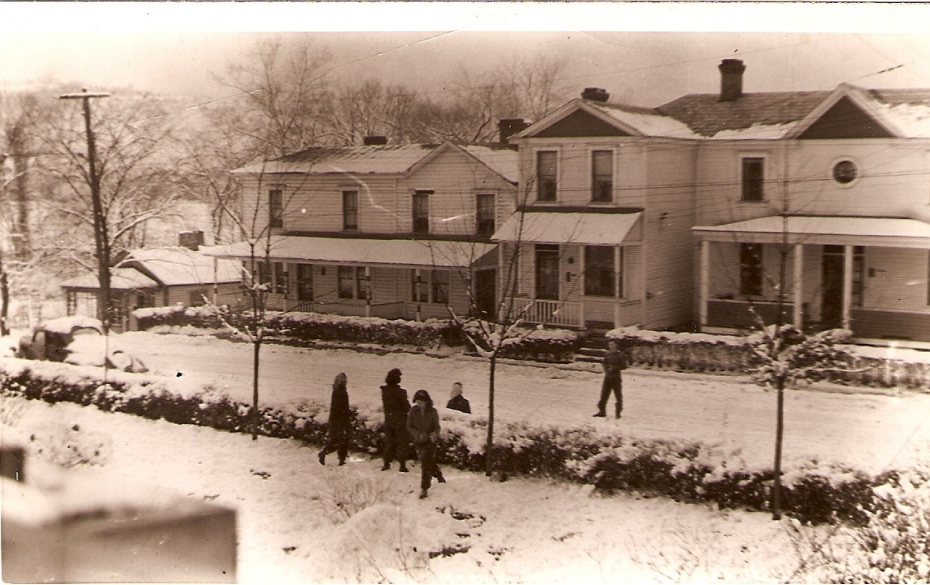
Early 30's photo of 700 block of Chess Street