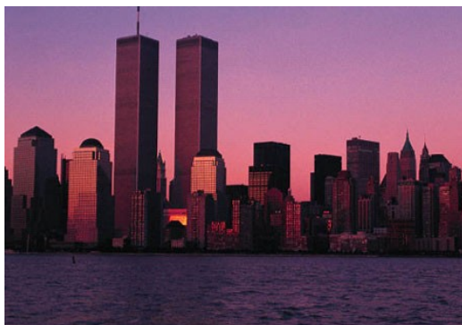
The Twin Towers before September 11, 2001

Who can ever forget where you were, what you were doing on that fateful Tuesday, September 11, 2001?