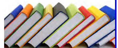
Friends of the Library Book Sale

The Friends of the Library will hold a used book sale on Friday, September 30th and Saturday, October 1st from 10 am to 5 pm at the library. Prices are reasonable and all proceeds are used to make the library better than it already is. If you wish to donate books, you can drop them off at the library. Please no reference books or text books. For more information visit friendsofbpl.org or contact the library at (412) 221-3737.