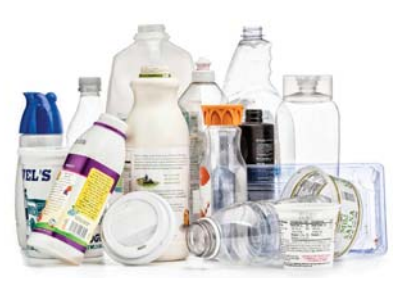
Plastic Bottles & Containers #1-5 & 7