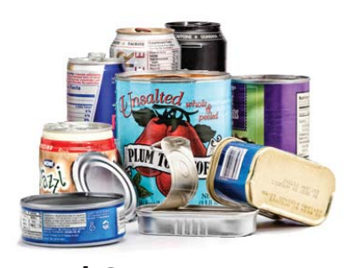
Metal Cans Steel, tin & aluminum soda, vegetable, fruit & tuna cans