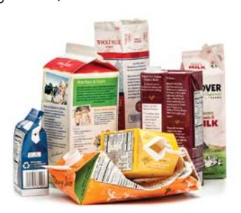
Paper Cardboard, Dairy & Juice Containers